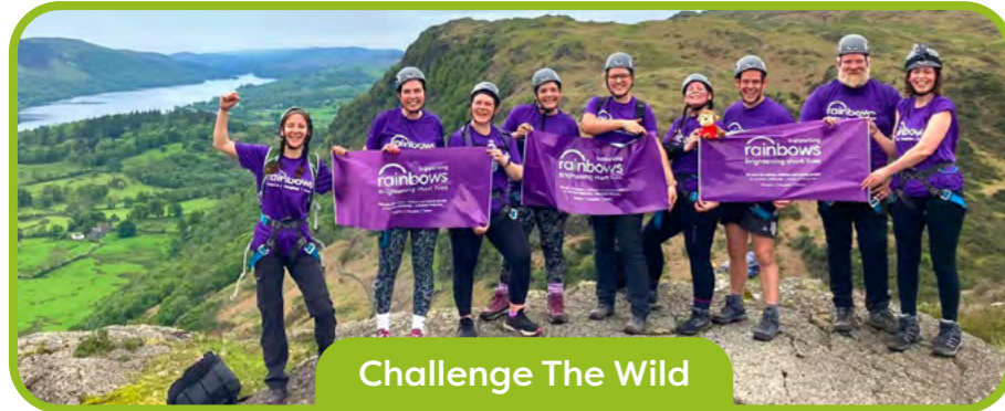
Challenge The Wild

From exploring the Lake District in our Challenge the Wild adventure, to tackling the iconic big red balls in our Totally Wiped Out obstacle course, there's been no shortage of excitement. Some brave supporters even took the leap of faith in our Skydive, while others enjoyed a more laid-back day on the golf course with our Corporate Challenge Cup. It's been a fantastic year full of fun and unforgettable moments!