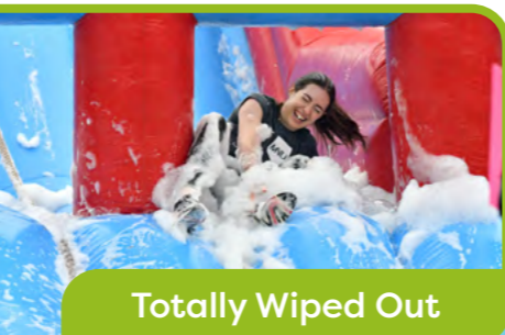
Totally Wiped Out

You always amaze us with your own fantastic events, and we love seeing the creative ways you come together to fundraise for Rainbows.