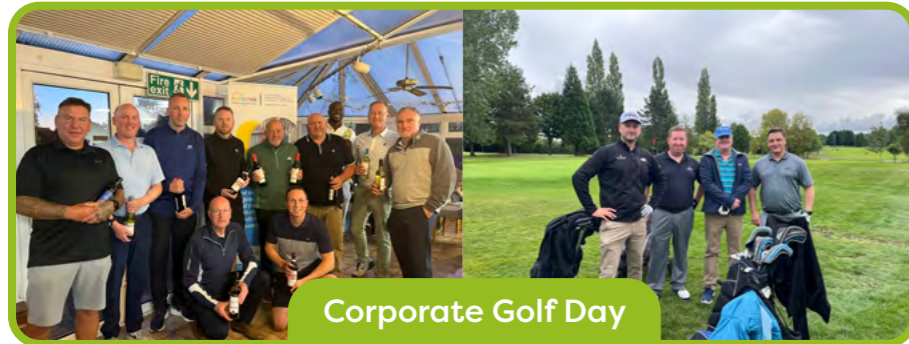
Corporate Golf Day