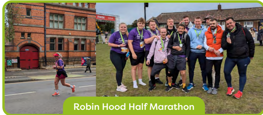
Robin Hood Half Marathon