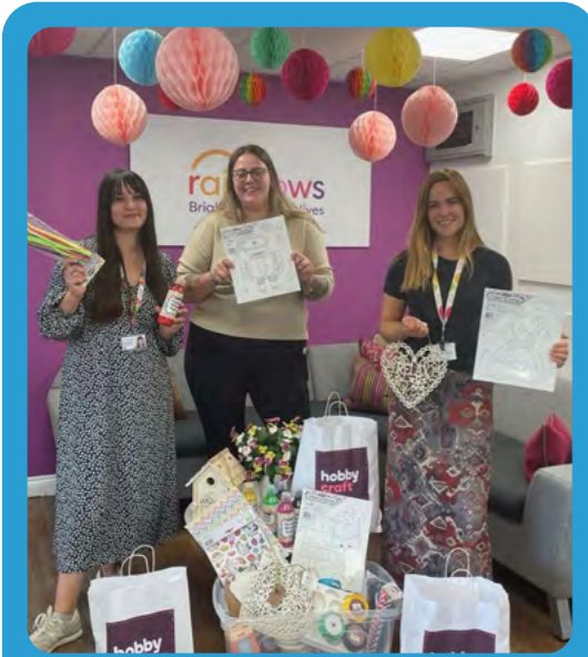
The lovely team at Hobbycraft Leicester donated a hamper of wonderful arts and crafts items for our children to enjoy.

Staff at Ideagen raised over £35,000 during our amazing two-year partnership and then surprised us by adding an extra epic fundraising event to take their total to £60,000! They set themselves the challenge of walking, running and cycling 30 miles from Nottingham Forest Football club to our Hospice and then back to Ideagen HQ for a well-deserved celebration party in just one day! A big thank you to Nottingham Forest Football Club and Nottingham Rugby Club for supporting them in this event.